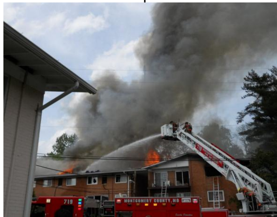
©2012 MCFRS Post Incident Analysis – 2815 Terrace Drive – 5/1/12