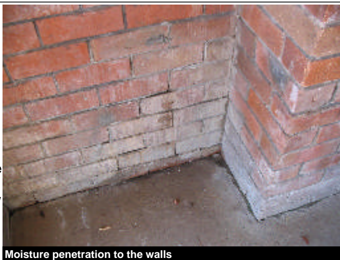
Moisture penetration to the walls

High moisture readings was detected to the walls below ground level using a moisture meter. This would indicate the lack of waterproofing or inadequate waterproofing to the backside of the walls that are below the ground.