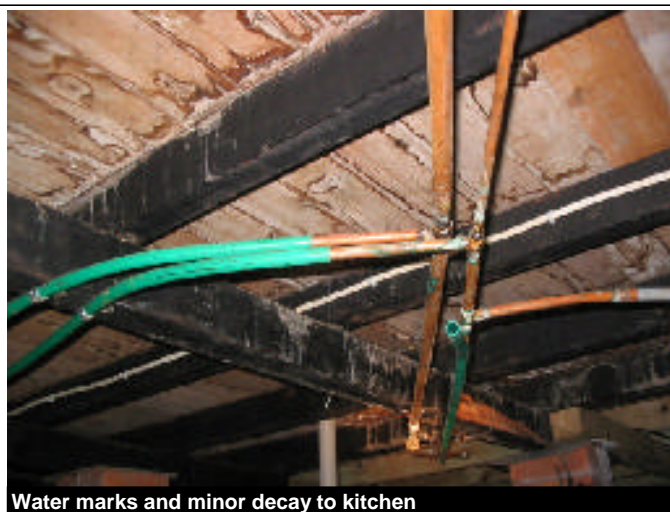
Water marks and minor decay to kitchen

Past water leaks and minor decay were noted under the kitchen from a past water leak.