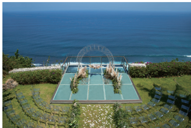
Sparkling Topaz IDR65,000++