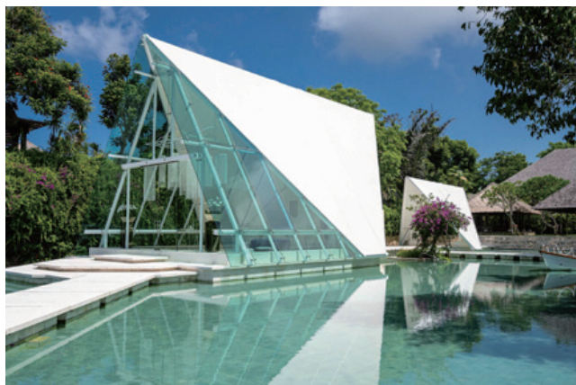
Gracious Pearl IDR51,000++