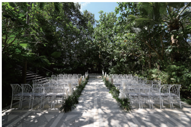
Brilliant Emerald IDR65,000++