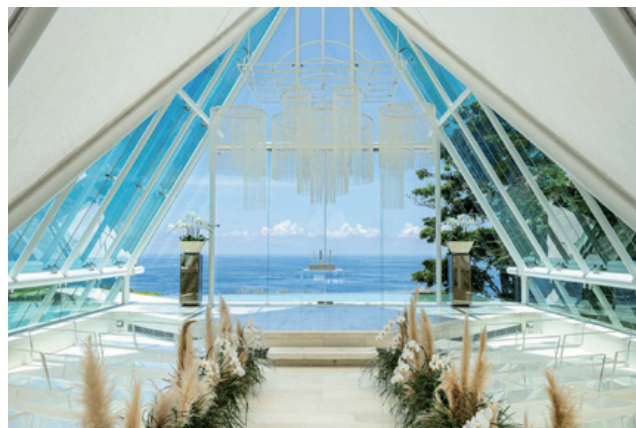
Dazzling Amber IDR65,000++