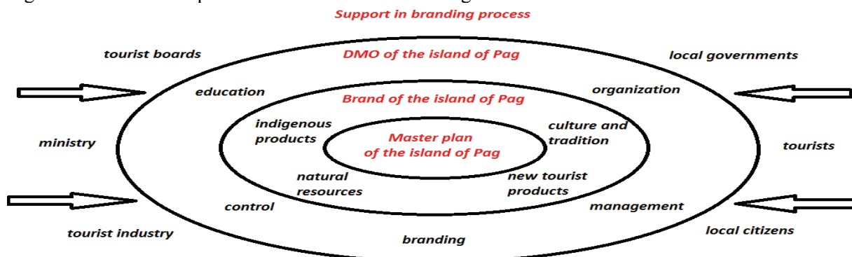
Figure 1: Brand development model of the Island of Pag

In a manner to create island of Pag year-round tourist destination, it is important to organize and promote its tourist offer during the whole year. Therefore, authors present a proposed model of brand strategy of the island which has been shown on figure 1.