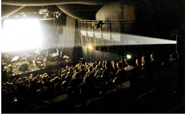
Boxhead Ensemble at the 2001 Dublin Film Festival.