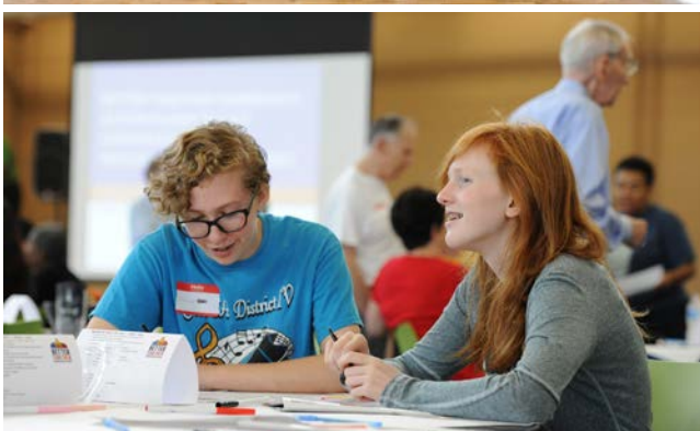
On August 29, 2015, a diverse crowd of more than 250 Decatur residents gathered to discuss issues of inclusion and fairness, devoting five hours of their Saturday to the Better Together mission.