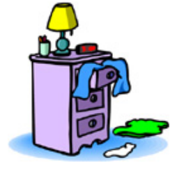
Pick up clothes