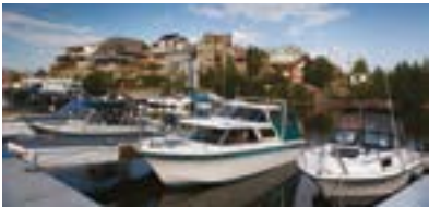
DAN BROSCHAK | NWT