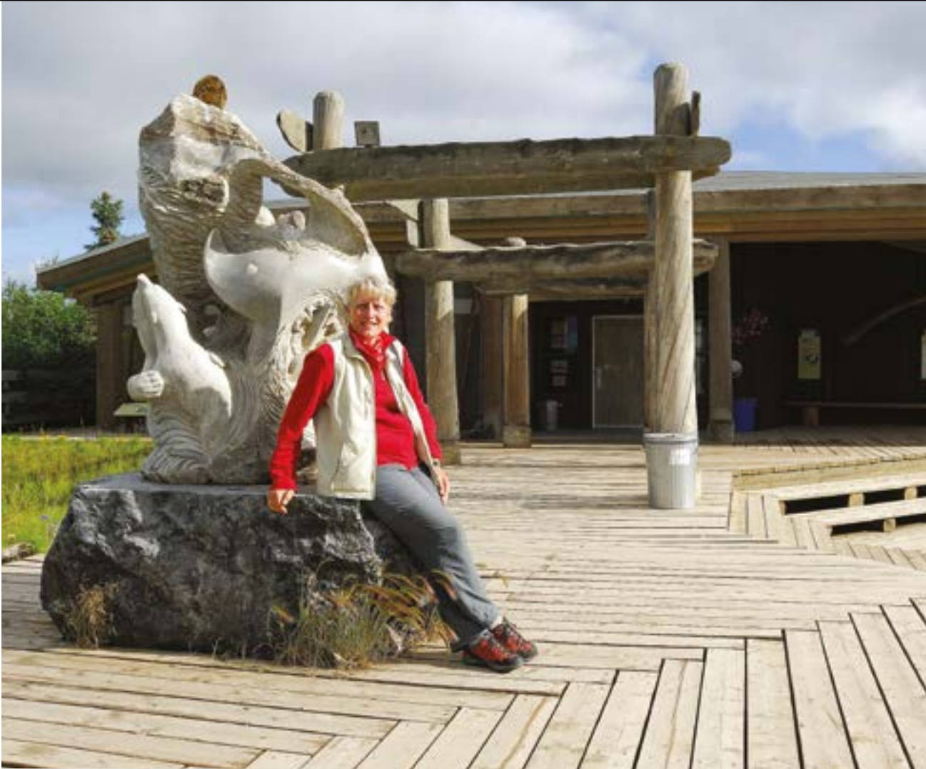
HANS PEAF / NWT