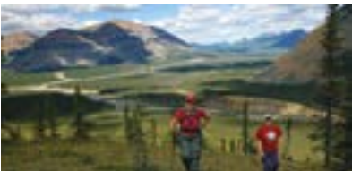
CAROL NORTH ADVENTURES

Hay River and Fort Smith are located south of Great Slave Lake. Hay River is an inland Arctic port, with sea-going tugs and barges, and a wide sandy beach. Fort Smith is headquarters for Wood Buffalo National Park, home to wood bison and the endangered Whooping Crane. White water enthusiasts play in the Slave River rapids in summer, while the park offers awesome star watching in autumn and winter.