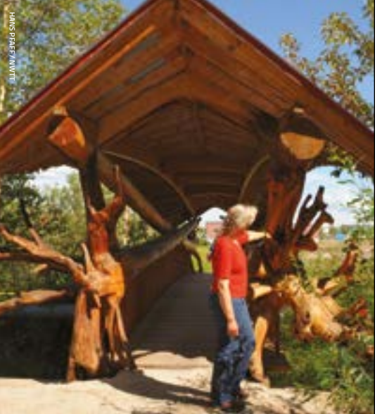
HANE PLAFER / NWTT