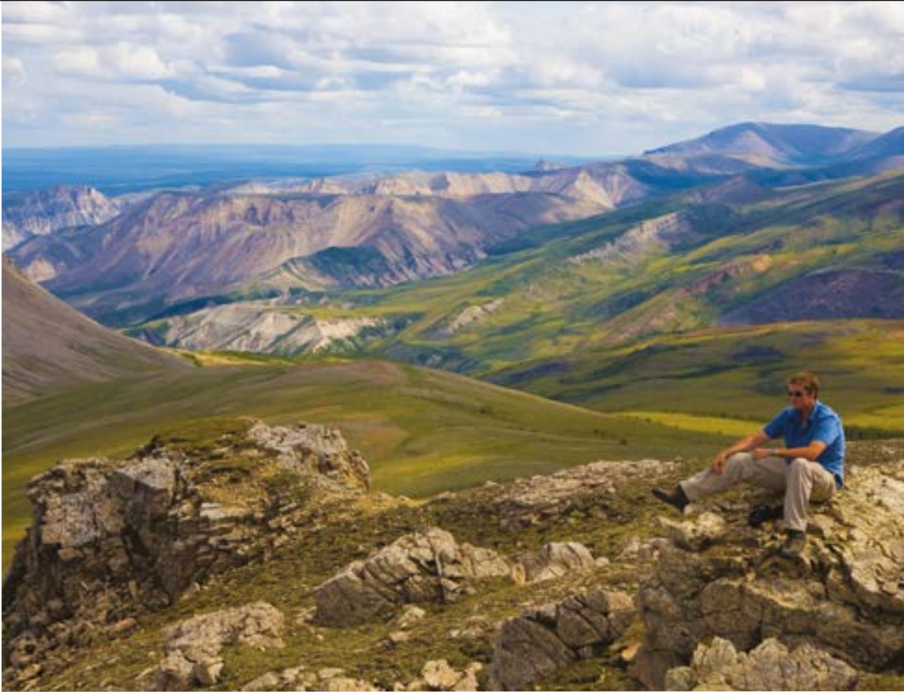
GEROLD SIGL / NWTT

For groups of less than 100, Norman Wells is an excellent choice. Two hotels have restaurants, and rooms range from $150 to $265 per night. The Norman Wells Heritage Centre tells the story of the oil find at Norman Wells and of the Canol Trail. There is a log cabin on site built by a Dene elder, and there are several interesting relics from the Canol era.