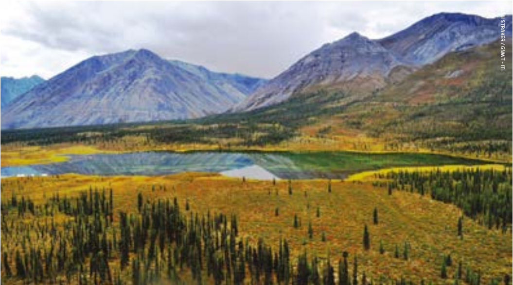
ILLUSTRATION / GWMT - ITI

To see our full listing of tours and activities, visit spectacularnwt.com or call our toll free number: 1-866-661-0788