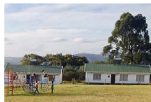
Lily of the Valley South Africa | Eston