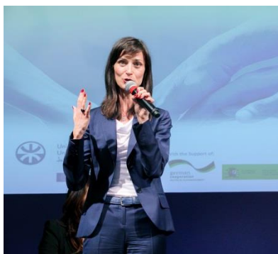
Mariya Gabriel , Member of the European Parliament, Bulgaria

"My interest for politics started when I was 15 and the sentence I have the most heard was "politics is not for everyone and much less for a woman". However, I always believed that for my country, changes can also come through political decisions. I succeeded to access to politics thanks to a new party which offered a large place for women. For me it was always clear that women in politics should not necessarily be responsible of organizing "charity events" or being in charge only of social affairs. I have been elected vice-president of the parliamentary group. In my country Bulgaria, there is no quota's law, but there is a high political commitment to allow women achieving high level positions. When I was elected in 2009 in the European Parliament, I realized that there is still a long way forward the parity in politics. Since then, my new objective as a politician is to advocate for an equal access of women in politics"