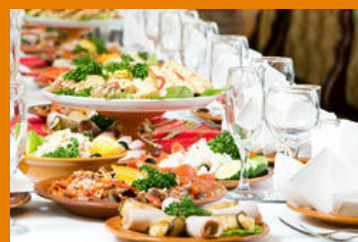
Food Service Planner