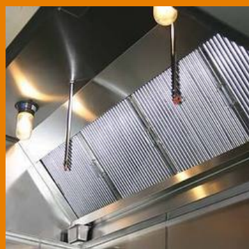
Kitchen Ducting Services