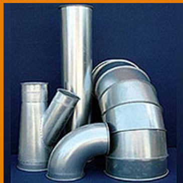
Kitchen Gas Tank Fitting