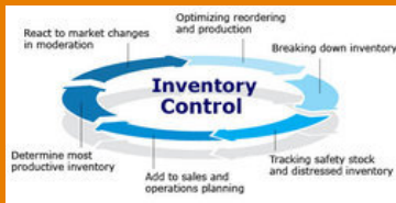
Inventory Control Services