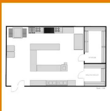
Commercial Kitchen Planner