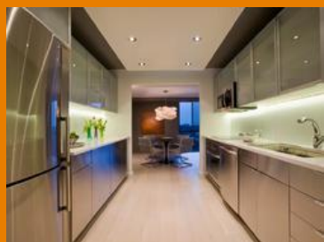
Kitchen Layout Design