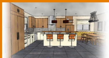
Interior And Architecture Of Kitchen