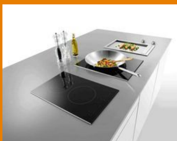
Live Kitchen/ Wok Design