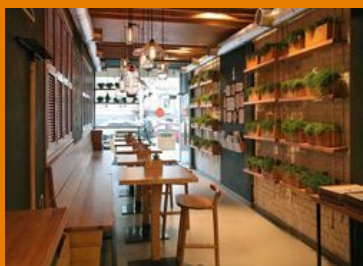
Cafe Design and Development