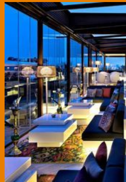
Sheesha / Hookah Bar Concept