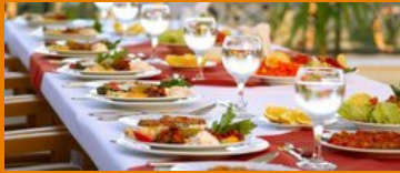
Food Catering Services