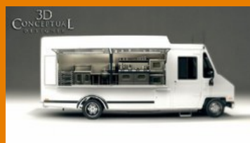
Food Truck Project