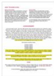
2. Inside Cover/ Acknowledgements