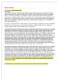
7. Program Notes