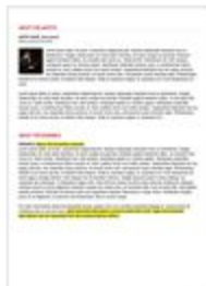
6. About the Artists/ About the Ensembles