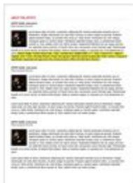
5. About the Artists