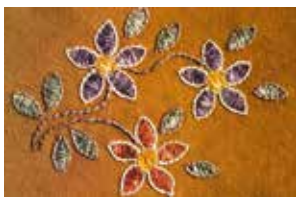
Cover Image: Dene quill work on moose hide [Photo taken by Tessa Macintosh]

CREDIT: NWT Archives/Northwest Territories. Dept. of Public Works and Services fonds/G-1995-001: 4336