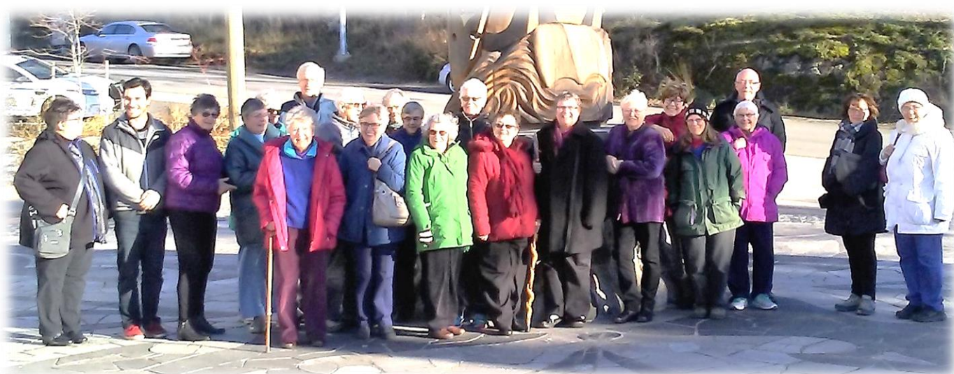
Songhees Wellness Centre Trip – January 10, 2017