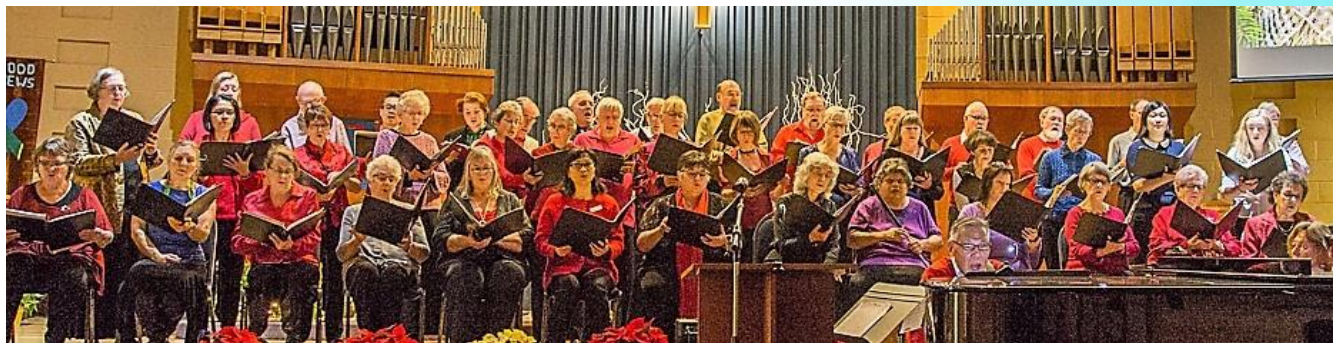
Carols by Candlelight Mass Choir

Music supports our community life at St. Aidan's. Music is with us in our celebrations and music is with us in our concerns and our sadness.