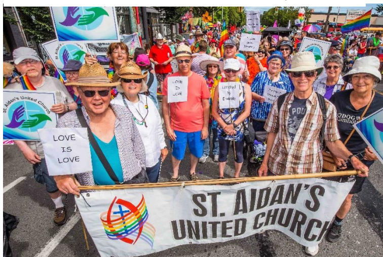
St. Aidan's marches in the Pride Parade on July 9, 2017