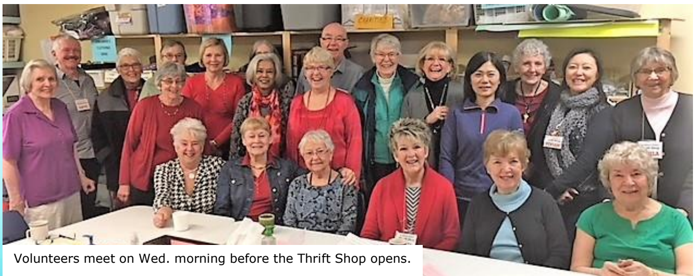
Volunteers meet on Wed. morning before the Thrift Shop opens.