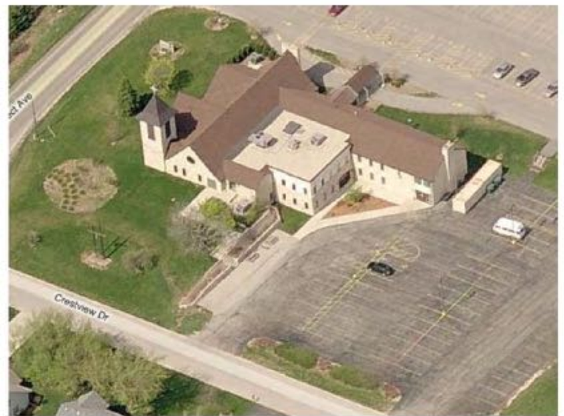
SOUTH / SOUTHEAST ELEVATION