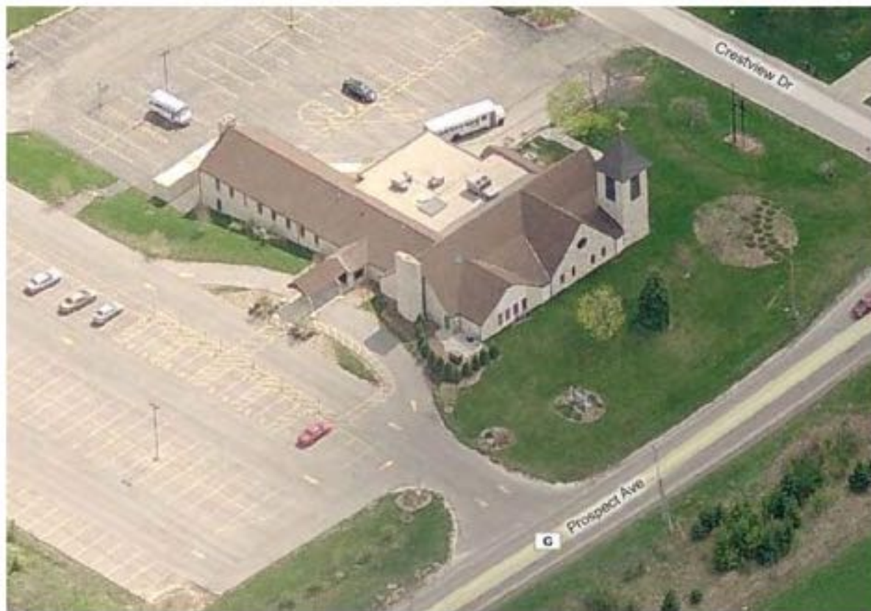
NORTH / NORTHWEST ELEVATION