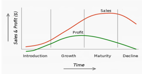
Sales and Profit Life Cycles

Most product life cycles are portrayed as bell-shaped curves, typically divided into four stages: introduction, growth, maturity and decline (Kotler, 2000)