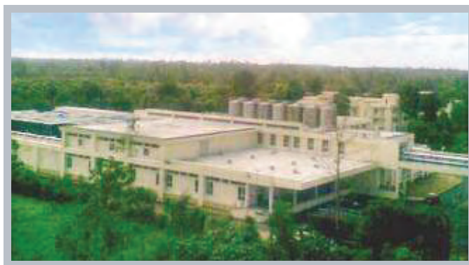
LIQUID MILK PACKING PLANT

IF UNDELIVERED PLEASE RETURN TO : UMANG DAIRIES LIMITED GULAB BHAWAN, 3RD FLOOR, 6A, BAHADUR SHAH ZAFAR MARG NEW DELHI - 110 002