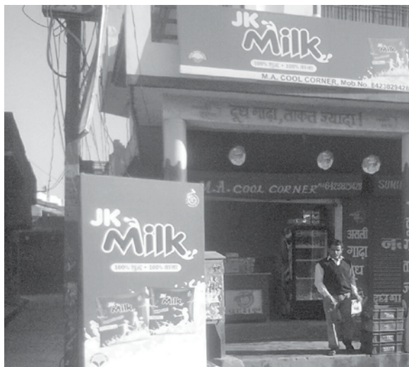
JK Milk branding in Lucknow