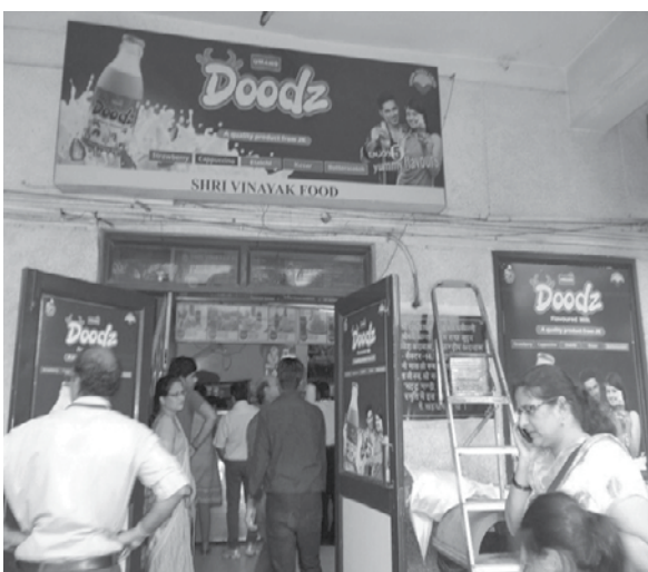
Doodz branding at Maharaja Agrasen hospital in Delhi

Geographical reach of Company's popular brands of Dairy Creamers - WHITE MAGIK, DAIRY TOP and MILK STAR – increased. On an average, Company is shipping 6-7 million sachets of consumer pack dairy creamers every month. Single serve sachets of White Magik are being supplied regularly to Air India, Jet Airways and Indian Railways as a part of tea & coffee kit. During the year, Company launched two new products – “ Doodz ” Flavoured Milk in NCR and poly pouched liquid milk in Lucknow under the brand name “ JK Milk ”. Both the products have been well received in the market place. Sales are gradually growing.