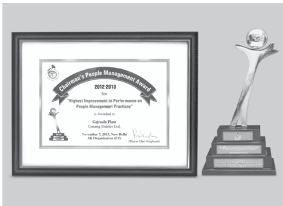
Chairman's People Management Award

For the second consecutive year, Company received Chairman's People Management Award for Highest Improvement in HR Practices.