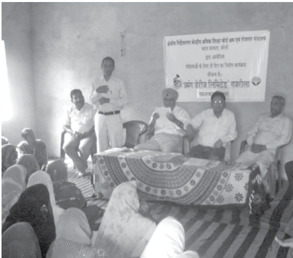
Work life balance training for rural women

Company has drawn a plan to increase its focus on CSR activities in the areas surrounding its factory.