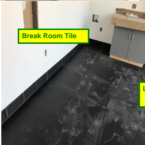
Break Room Tile