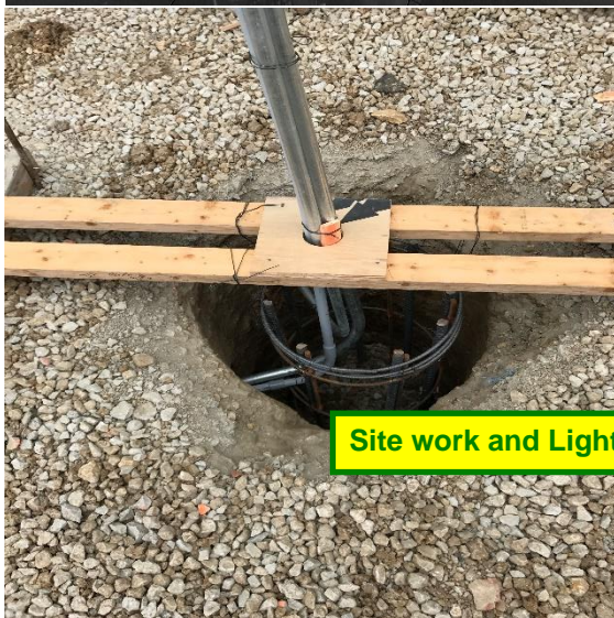
Site work and Light Pole Foundation.