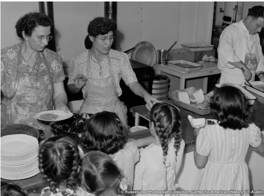
Serving hot lunch rwl14233_0026