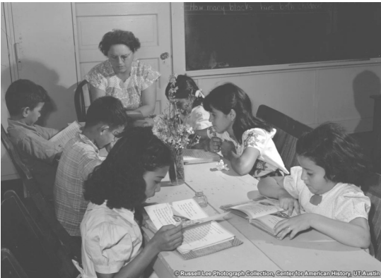
Reading class rwl14233_0029