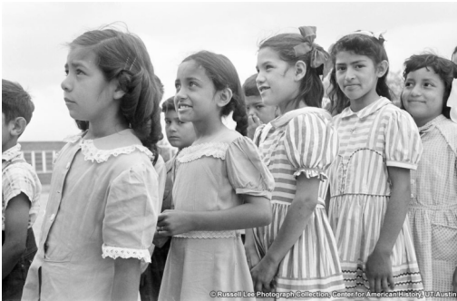
School children rw114233r3_0015