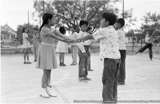
Grade school children at play rw114233r3_0010