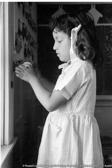
Sharpening pencil rw114233r3_0019