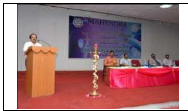
(Day-1 Key note Address)