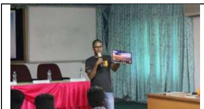
(Day 2 key note address)