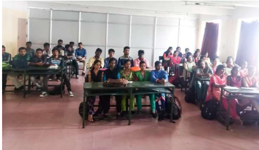
Campus Connect Webinar on “LPWA communication technologies” on 8 th September 2017 at Mahendra College of Engineering, Salem