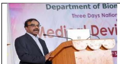
(Day 1 key note address)