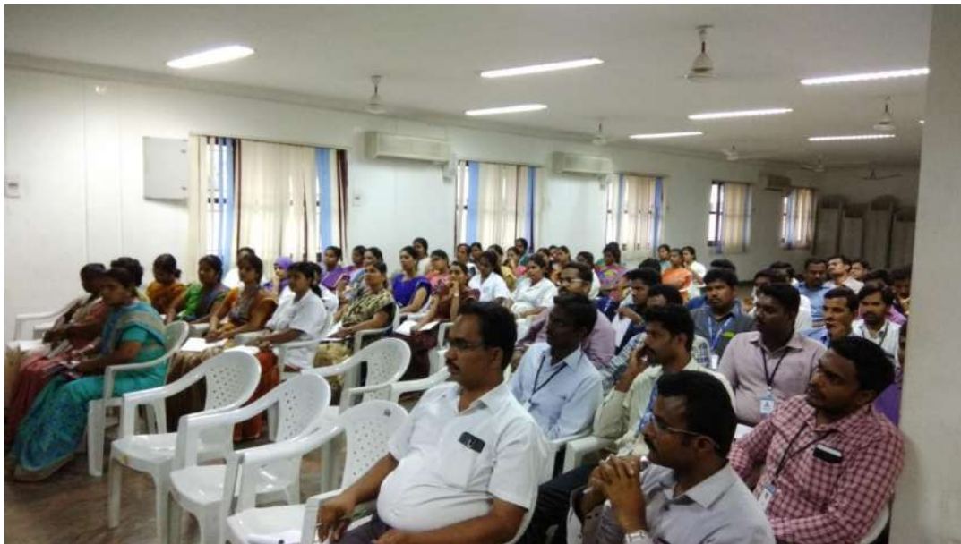
The faculty members from various departments participated in the program.