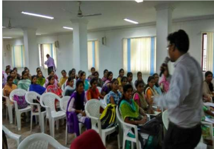
The resource person from Caliber Technologies briefing the students about the workshop