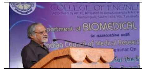
(Day-2 Key note Address)