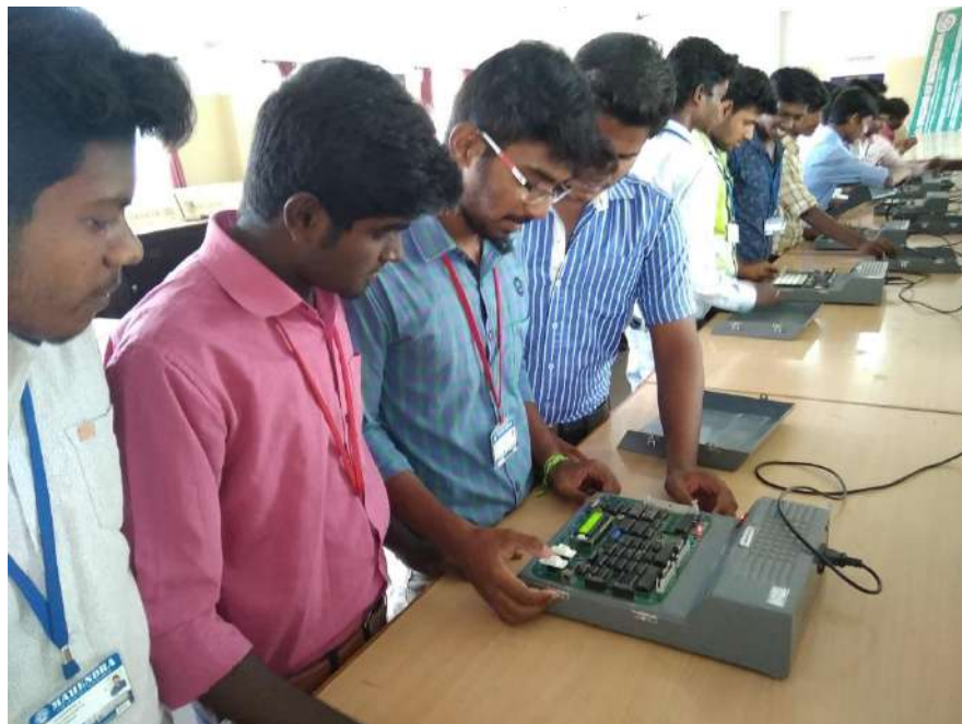
The students were practicing with microprocessor during the workshop.