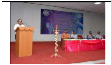
(Day-1 Key note Address)