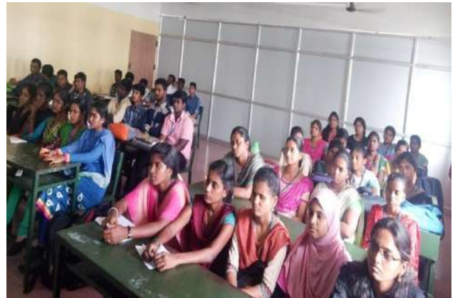
Campus Connect Webinar on “IoT Platform” on 29 th Aug 2017 at Mahendra College of Engineering, Salem