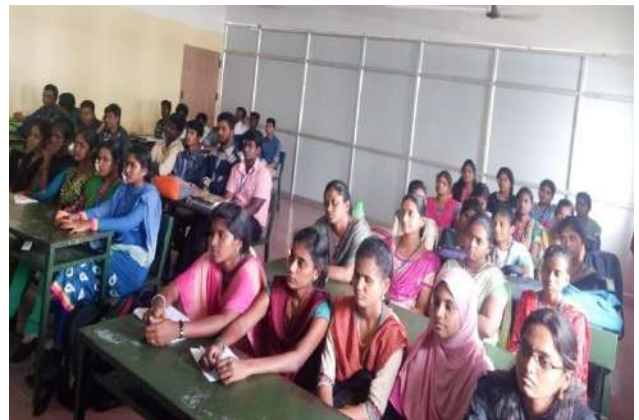
Campus Connect Webinar on “IoT Platform” on 29 th Aug 2017 at Mahendra College of Engineering, Salem