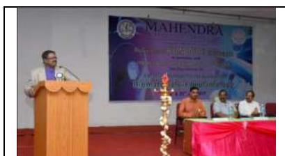
(Day-1 Presidential Address)