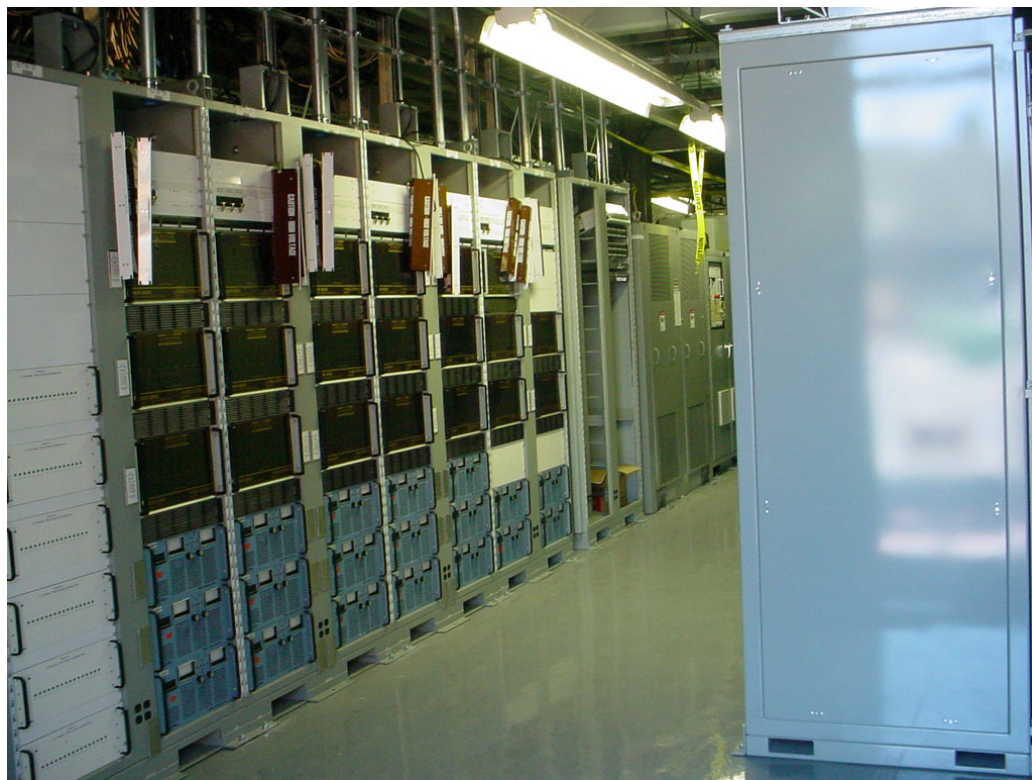
Power Supply racks installed in B118

Significant progress has occurred on the new power supply building B118 with installation of rack mounted power supplies, AC distribution conduits and final cable trays (see picture below).