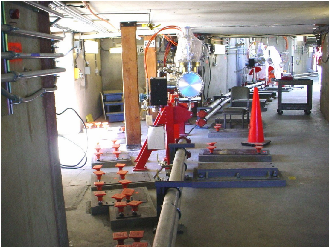
View of support plates, LCW headers and beam line FE components installed in SPEAR North arc

After the successful core drilling of approximately 2,000 holes in the new concrete floor, the contractor installed the required hardware and studs that secure the magnet raft support plates. The SLAC alignment group then aligned the support stands to the required .005" tolerance in all degrees of freedom and finished with a final mapping of the critical alignment pins. Under the direction of LeCocq all of the alignment activities in the ring have met or exceeded the scheduled times. Upon completion of the mapping, the support stands were then grouted to provide the vertical stability necessary for the magnet lattice. All support plates met the requirements without need for in-field modification, which is directly attributed to the oversight by the SSRL field engineers Dell'Orco and Cadapan.