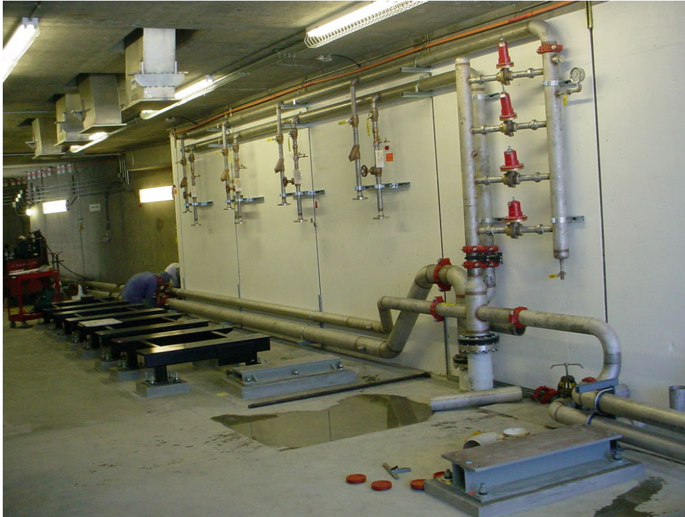
J.D Collins company completing LCW in the SPEAR West straight

Some of the LCW headers were installed during July with the remainder scheduled for August. All units fit onto the pre-drilled mounting holes as designed.