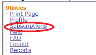
Figure 6-39: Subscriptions