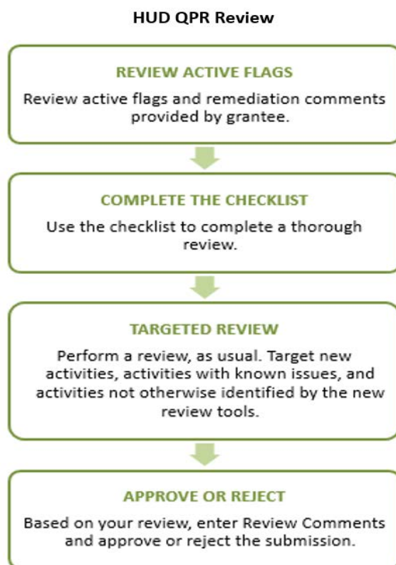
Figure 6-41: HUD QPR Review Work Flow

The following chart includes HUD QPR Submission Review tips (Figure 6-40).