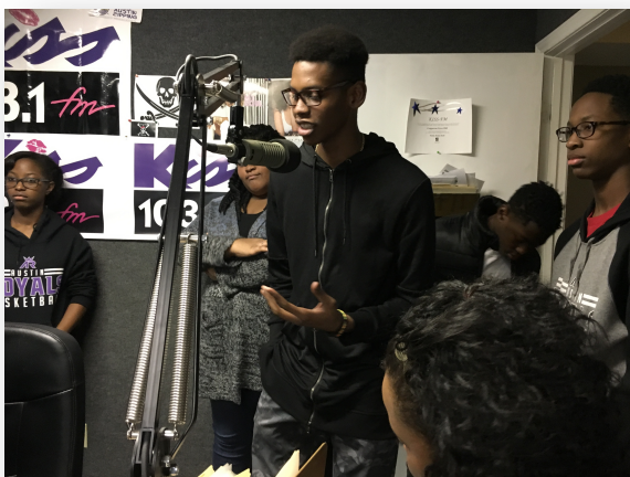
YJ Leaders On-Air at Kiss 103.1 FM

The program and events provide young people with entrepreneurial learning opportunities, resulting in culminating events that strengthen and position them in international economic development and discovery of their innate entrepreneur skills, abilities and talents.