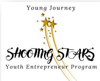
GUEST SPEAKER TOPIC: _____