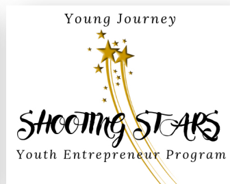
GUEST SPEAKER TOPIC: _____