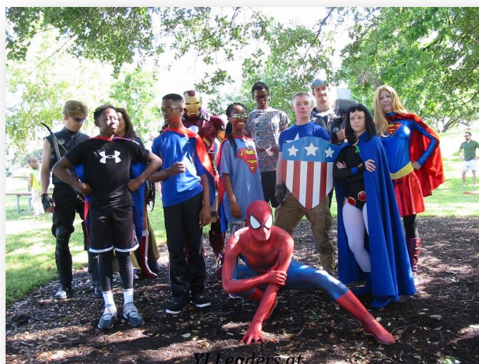
YJ Leaders at Children's Mental Health Awareness Day, Austin, TX