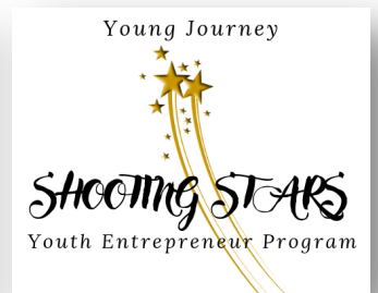
GUEST SPEAKER TOPIC: _____