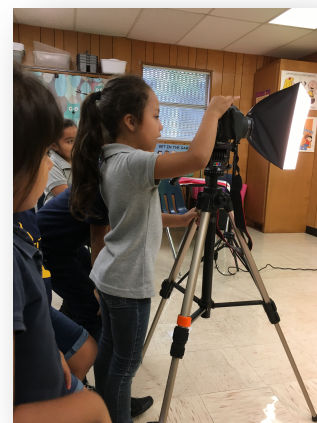
YJ Elementary School Media Arts Program

Date: Summer 2020 Time: TBD Location: Atlanta, GA (Venue TBD) Projected Attendance: 500 plus