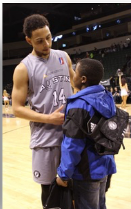
YJ Leader inspired by Stephen Curry