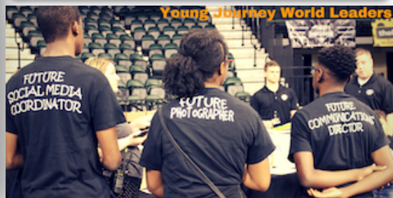
YJ Preparing for Austin Spurs Game Day Shadowing