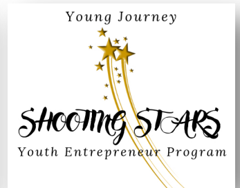
GUEST SPEAKER TOPIC: _____