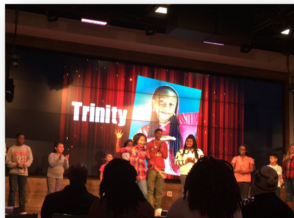
YJ Leaders Presenting Live at Google