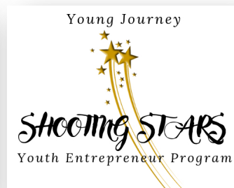
GUEST SPEAKER TOPIC: _____