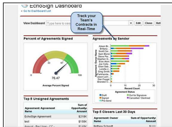
Use EchoSign for Salesforce to track your team's performance