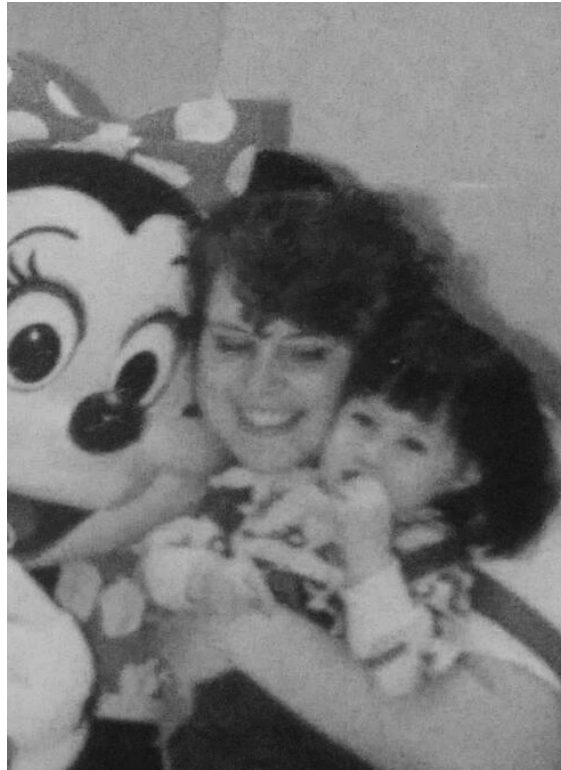
Figure 2. My mother holding me in public at a shopping mall Toledo, Ohio, 1992