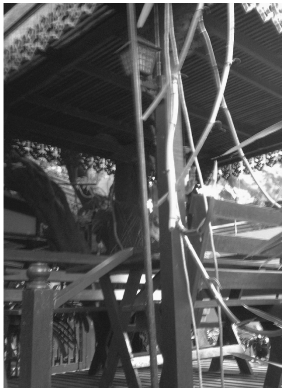
Figure 3. Corner of the ศาลา 1 in the center of my father's family compound

Banglamphu, Bangkok, Thailand, 2012