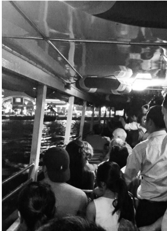
Figure 6. View from the back of a crowded public passenger boat taxi Chao Phraya River, Bangkok, Thailand, 2013