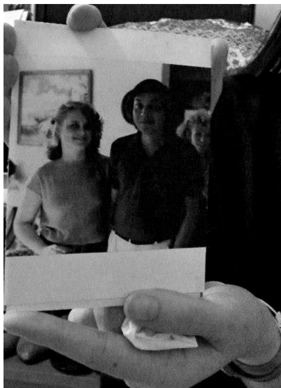
Figure 5. Me showing P'Hem a photograph of my parents that my father gave to me Bangkoknoi, Bangkok, Thailand, 2013