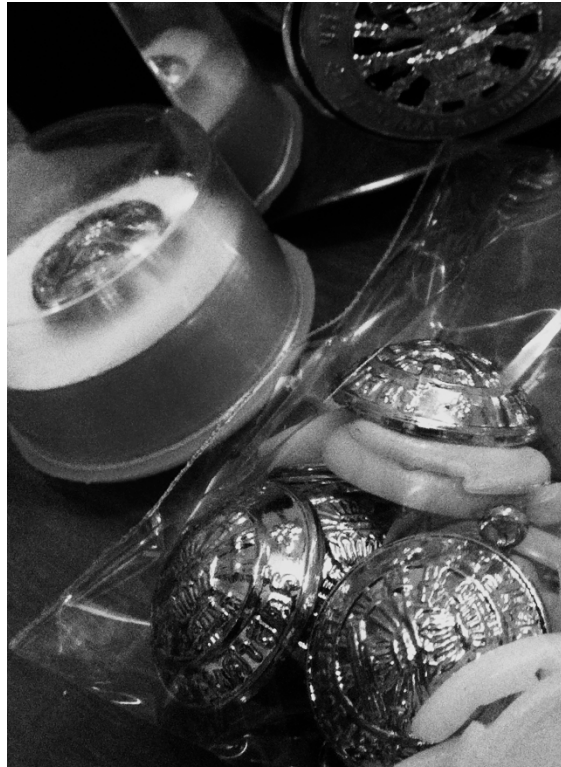
Figure 1. Pieces of my Thammasat University uniform Bangkoknoi, Bangkok, Thailand, 2012