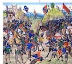
Lots of War and Chaos