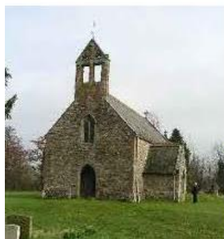
Charlemagne converts to Christianity and preserves and helps to unite Europe