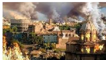
Fall of Rome