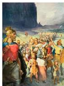
Germanic Tribes Take Over Europe