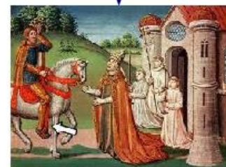
Church becomes the central power in Europe

Feudalism eventually emerges as a governmental and social organization