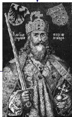
Much of Europe was reunited by Charlemagne