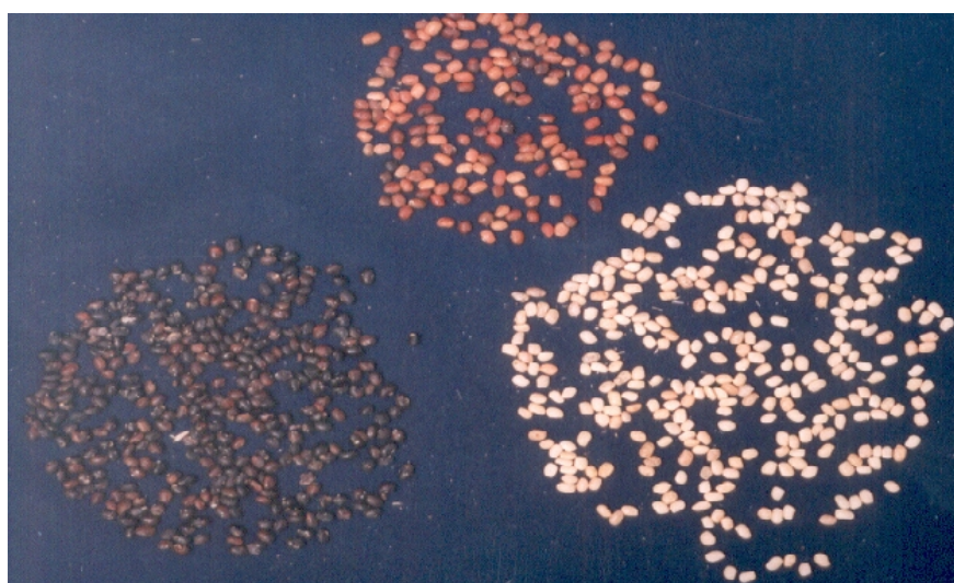
Fig. 5: Horse gram diversity

Deploying agricultural biodiversity more effectively is not simply a return to traditional