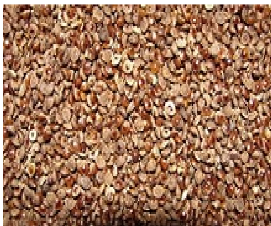
Fig. 2: Kodo millet ( Paspalum scrobiculatum )