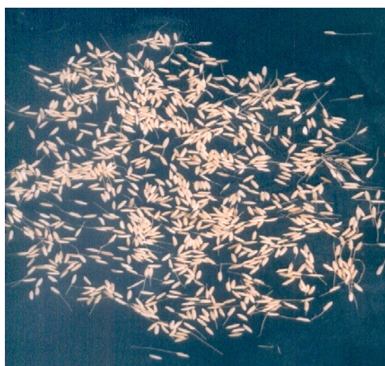
Fig. 3: Rice variety Azusena