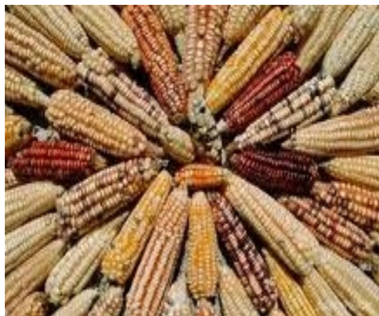
Fig. 1: Diversity in maize