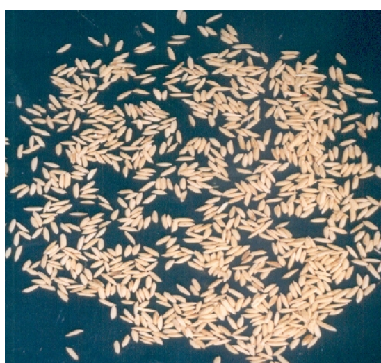
Fig. 4: Rice variety Ramsar