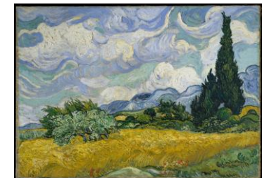
Figure 4. Van Gogh's distinctive brushwork in Wheat Field with Cypresses , 1889.