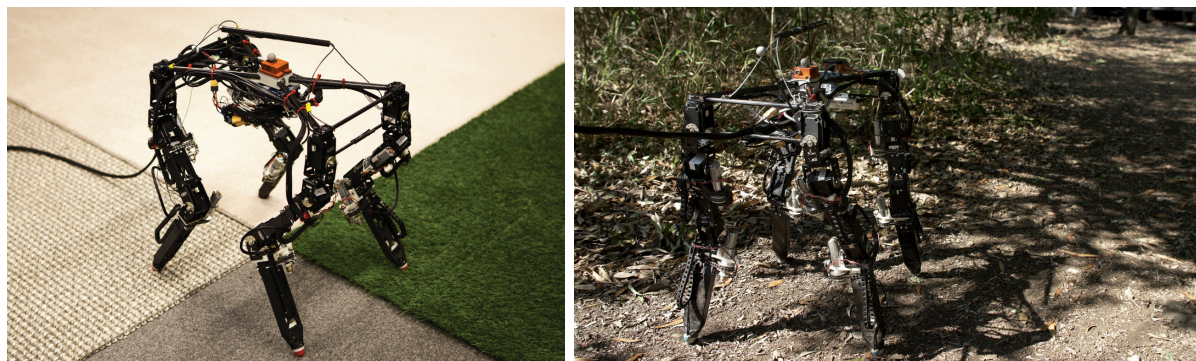
Figure 2: The robot on the four different walking surfaces is was tested on in our work on adapting to the operating environment in the lab [12] to the left. We showed that evolution was able to utilize both control and morphology to adapt to different environments. We also showed the results could generalize to new and unseen environments. The right shows the robot during testing of our online adaptation algorithm in outdoor unstructured terrains [13]. Here, the robot was able to exploit limited training in the lab to quickly and efficiently adapt its body to new and unseen environments.

morphology without having to consider the external environment to a large degree. We applied a co-evolutionary approach of morphology and control to adapt to different battery voltages that would be present during operation, and found that the evolutionary algorithm was able to exploit both the control and morphology in its adaption [11]. The next step was to introduce the environment, and we did a similar evolutionary adaptation to different walking surfaces. There, we observed that the system was able to exploit both morphology and control to adapt to its external environment, and that the results generalized well to previously unseen walking surfaces as well [12]. Even though demonstrating that the results generalize bodes well for its applicability to real-world problems, it was still an offline approach. Even though it works in hardware, there is still a gap in performance and robot behavior between the lab environment and its final operating conditions outside. In our next experiment, we implemented an online approach to learning where minimal training in controlled environments inside helped bootstrap the learning process. We found that this allowed the robot to adapt its morphology while walking in challenging unstructured outdoor environments and continuously improve its model as it walked [13].