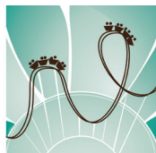
Goal progress chart