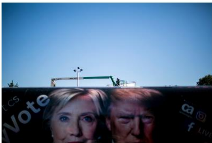
Images of Hillary Clinton and Donald J. Trump on the side of a CNN truck outside Hofstra University in Hempstead, N.Y. The candidates hold their first debate tonight.

The New York Times sale has begun. Subscribe today and get 50% off for one year. Save now.