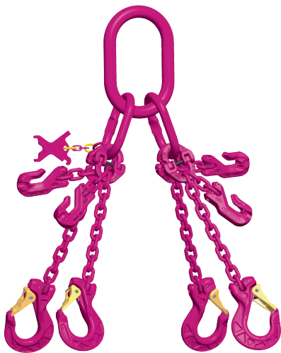
Connection with IVH-3/4-leg