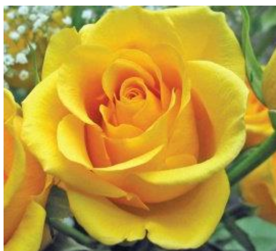
Fig. 3. Example of an image with acceptable resolution