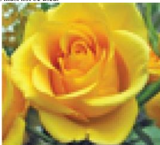
Fig. 2. Example of an unacceptable low-resolution image

Page numbers, headers and footers must not be used.