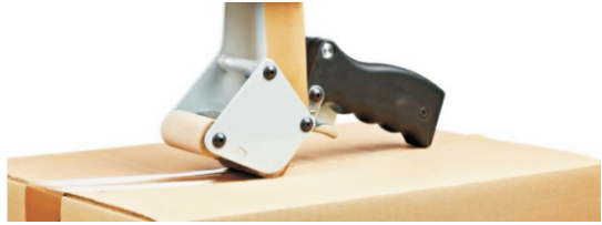
Repacking of supplies for distribution