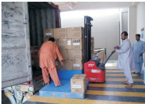
Dispatching consignment at the Central Warehouse & Supplies Karachi