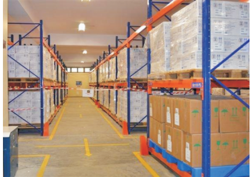
Storage of supplies at Central Warehouse & supplies, Karachi