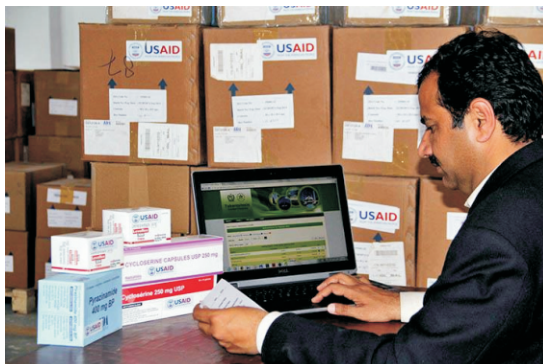
Receiving supplies and updating the Warehouse Management System