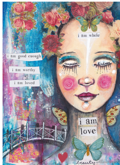
Painting and Collage