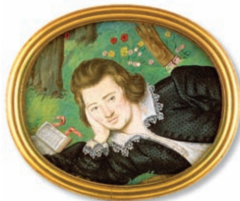
Henry Percy, 9th Earl of Northumberland (1595), Nicholas Hilliard.

In 13th-century Italy, poets introduced a poetic form called the sonnet, an Italian word meaning “little song.” The sonnet is a 14-line lyric poem with a complicated rhyme scheme and a defined structure. Because of the technical skill required to write a sonnet, the form has challenged poets for centuries. The great Italian poet Francesco Petrarch (1304–1374) perfected the Italian sonnet , which is often called the Petrarchan sonnet in his honor. Petrarch felt that the sonnet, with its brevity and musical rhymes, was a perfect medium for the expression of emotion, especially love. Although Italian sonneteers did not restrict themselves to love as a subject, Petrarch wrote over 300 sonnets detailing his devotion to a beautiful but unobtainable woman whom he called Laura.