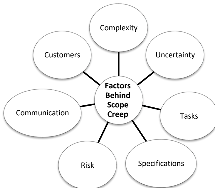
Figure 1: Causes of Project Scope Creep

Therefore, defining the project constraints and the relationships within a project fosters the exchange between the project and its environment and facilitates control. Moreover, defining these boundaries allows for the use of project management tools and techniques in isolation from environmental influences (Atkinson et al. , 2006). Figure 1 highlights the causes of scope creep mentioned in the literature: