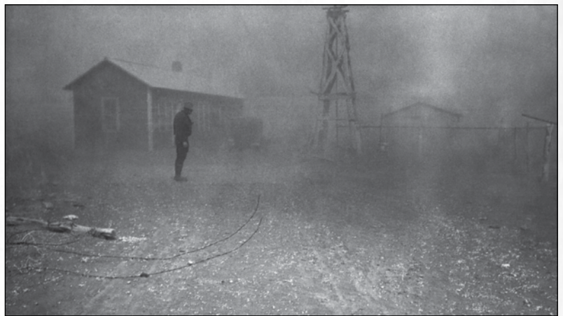
April 14, 1935 became known as "Black Sunday" when the largest dust storm yet roared across the plains.

4.) Life in North America was bleak but there was a beacon of hope on the horizon and his name was Franklin Delano Roosevelt (FDR). Considered the greatest U.S. president by many historians, Roosevelt beat Hoover by a landslide in the 1932 election and introduced his bold New Deal , a plan that set economic recovery in motion during the first 100 days of his presidency. Among his speedy accomplishments was the creation of the Civilian Conservation Corps, which put more than 250,000 young men to work in national parks. While they fought forest fires, planted trees and built roads in the national parks, these men also received education. Some were taught to read and others prepared for college. More