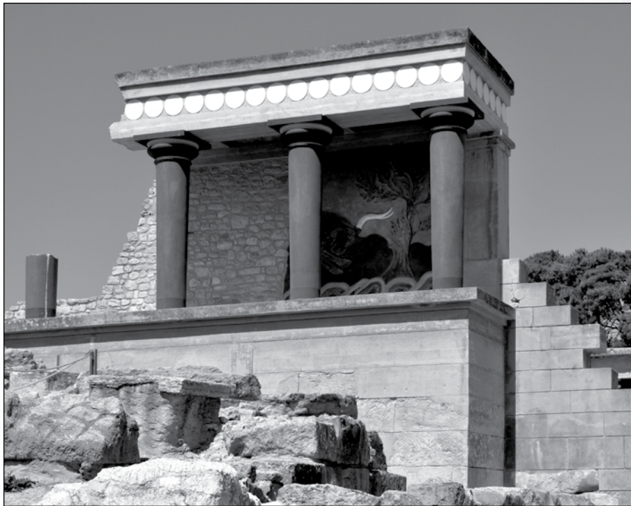
(caption) Knossos Palace

2.) Of the 60 islands in this Mediterranean paradise, the Greek Island of Crete is the largest and the most visited. Spanning about 8,000 square kilometers (or 3,088 square miles) this gorgeous island attracts more than 3 million