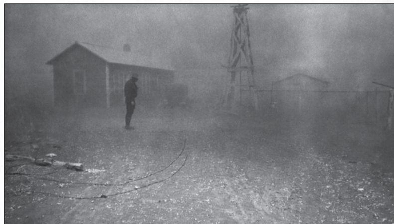
April 14, 1935 became known as "Black Sunday" when the largest dust storm yet roared across the plains.

Life in North America was bleak but there was a beacon of hope on the horizon and his name was Franklin Delano Roosevelt (FDR). Considered the greatest U.S. president by many historians, Roosevelt beat Hoover by a landslide in the 1932 election and introduced his bold "New Deal" , a plan that set economic recovery in motion during the first 100 days of his presidency. Among his speedy accomplishments was the creation of the Civilian Conservation Corps , which put more than 250,000 young men to work in national parks. While they fought forest fires, planted trees and built roads in the national parks, these men also received education. Some were taught to read and others prepared for college. More than 2.5 million young men benefited from this program and