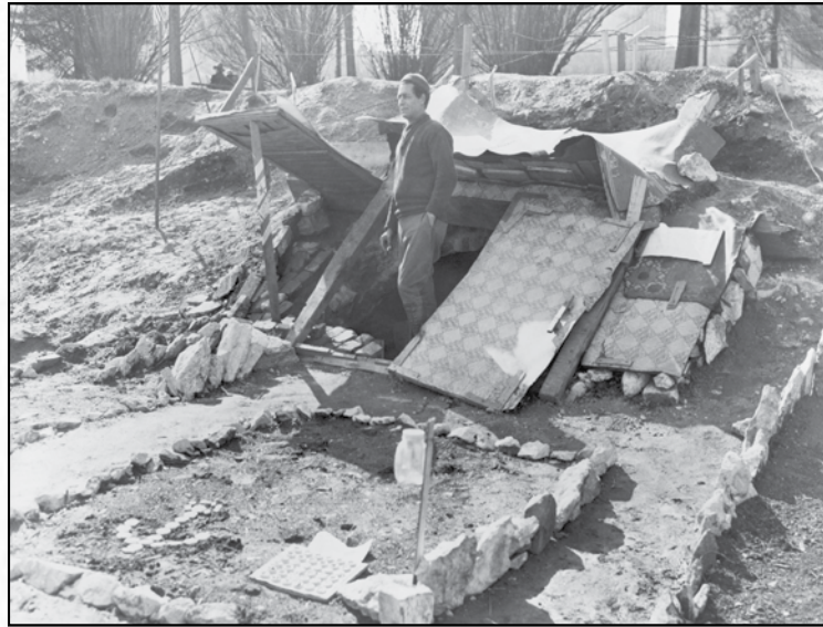
One of the first settlers in the Hooverville of New York’s Central Park.

2.) The Great Depression began with the largest stock market crash the world had ever known in October of 1929. People lost their savings, their jobs and their homes. Dreary, makeshift encampments where the homeless took shelter sprang up in cities across the nation. One of the largest was in New York City’s Central Park. Covering 9 acres, it was home to 15,000 down-and-out individuals. By 1931, such large shantytowns could be found in the cities of Chicago and St. Louis, and on the outskirts of many other cities.