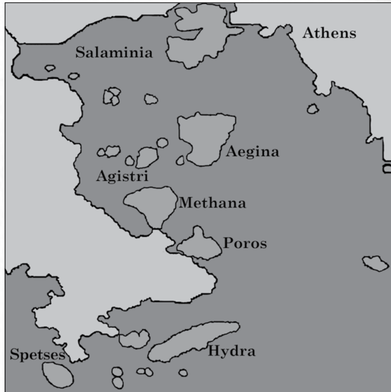
(caption) Map of Greek Islands

5.) Whether you're curious about ancient history, eager to enjoy some of the world's finest beaches or both, the Greek Isles are a