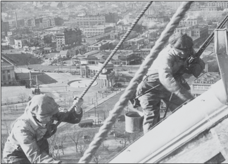
Workmen cleaning and painting the gold dome of the Denver Capitol.

5.) From the despair of life in Hooverville and the whirling menace of the Dust Bowl came the promise of FDR's inspirational leadership and his daring New Deal. Without a doubt, the years of the Great Depression were among the most challenging in history for the people of North America.