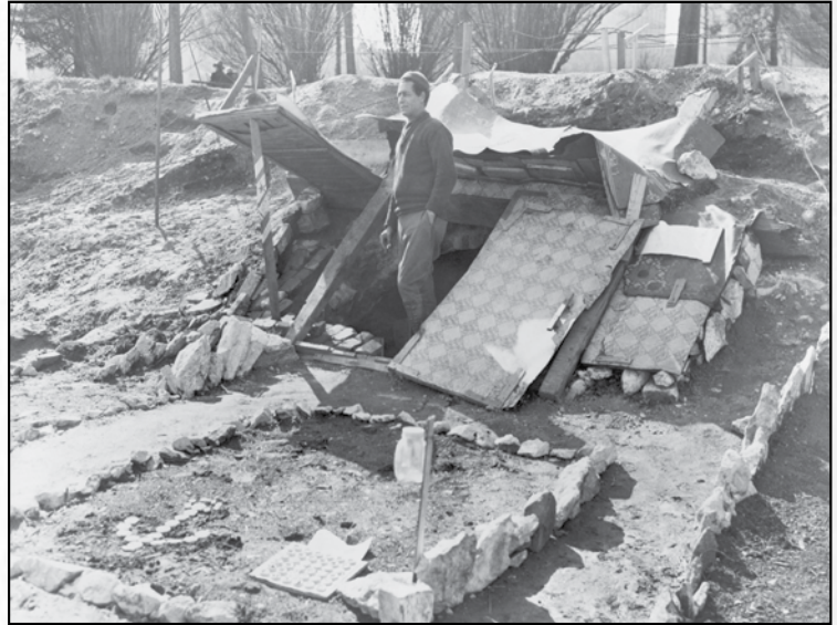
One of the first settlers in the Hooverville of New York’s Central Park.

The Great Depression began with the largest stock market crash the world had ever known in October of 1929. People lost their savings, their jobs and their homes. Dreary, makeshift encampments where the homeless took shelter sprang up in cities across the nation. One of the largest was in New York City’s Central Park. Covering 9 acres, it was home to 15,000 down-and-out individuals. By 1931, such large shantytowns could be found in the cities of Chicago and St. Louis, and on the outskirts of many other cities.