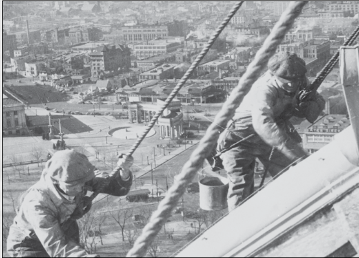
Workmen cleaning and painting the gold dome of the Denver Capitol.

From the despair of life in Hooverville and the whirling menace of the Dust Bowl came the promise of FDR's inspirational leadership and his daring New Deal. Without a doubt, the years of the Great Depression were among the most challenging in history for the people of North America.