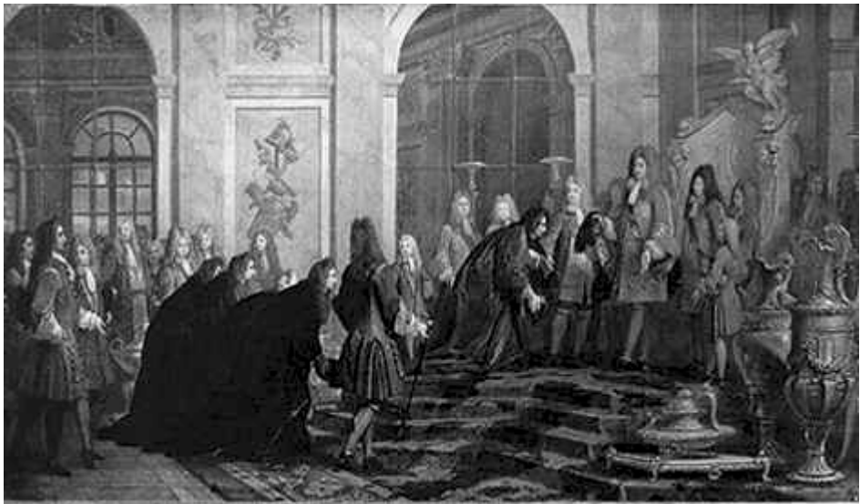
Marseille, musée des Beaux-Arts

Analyze the ways in which the contrasting styles of these two paintings reflect the different economic values and social structures of France and the Netherlands in the seventeenth century.