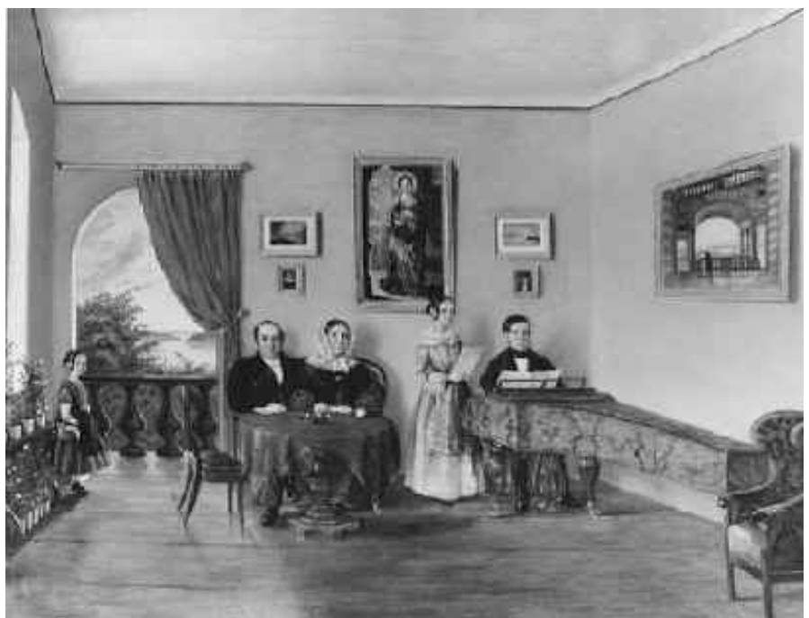
Historisches Museum der Stadt Wien

Contrast how a Marxist and a Social Darwinist would account for the differences in the conditions of these two mid-nineteenth-century families.