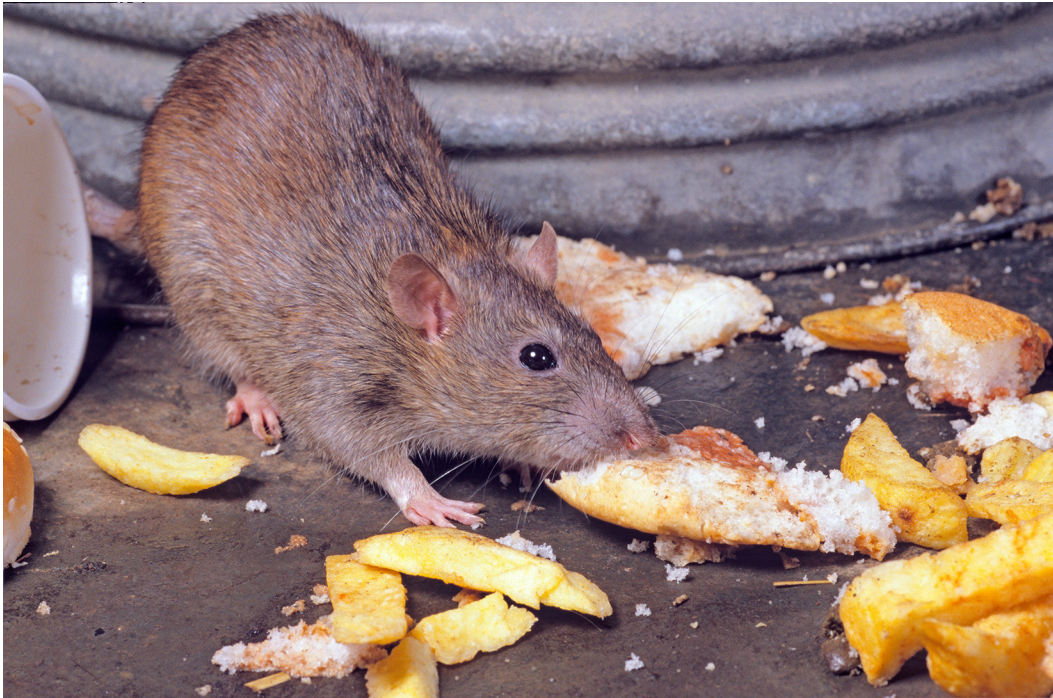
A city rat enjoys a tasty snack. In New York City, brown rats in different neighborhoods have accrued genetic differences. The populations appear to be kept apart by intervening areas with more intense rat control and less human food to feast on.

Observing how creatures respond to urban life also may help to improve conservation management or pest control, and to plan cities with functioning ecosystems that are environmentally more robust and better places for people to live.