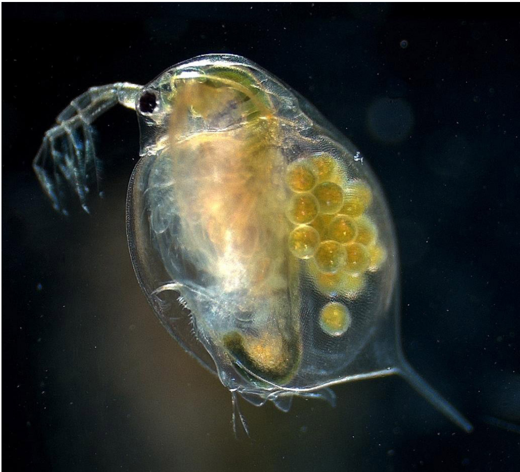
Scientists studying the water flea Daphnia magna in rural and urban ponds have identified gene-based differences in traits such as tolerance to water temperature.

A follow-up study published in 2018 showed that urban Daphnia have significantly higher concentrations than rural water fleas of total body fat, proteins and sugars, trait changes that are associated with handling stresses such as heat as well as with faster life cycles.